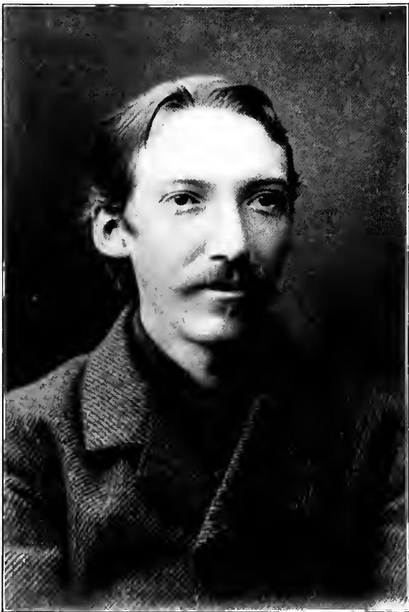
ROBERT LOUIS STEVENSON (An unpublished portrait)